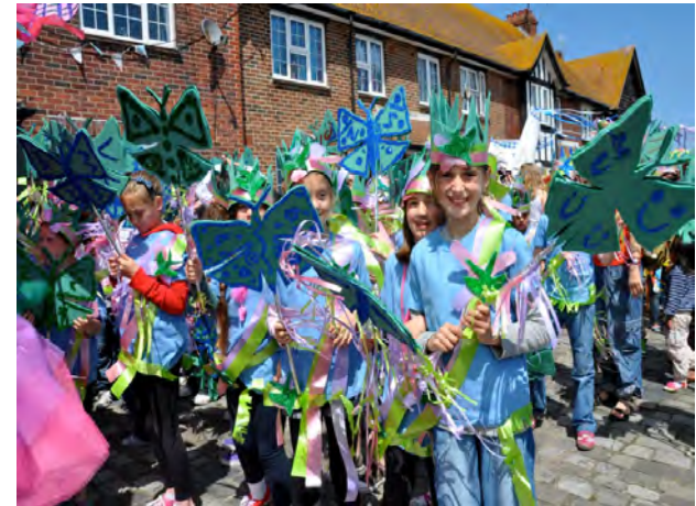
Local children taking part in the Charivari