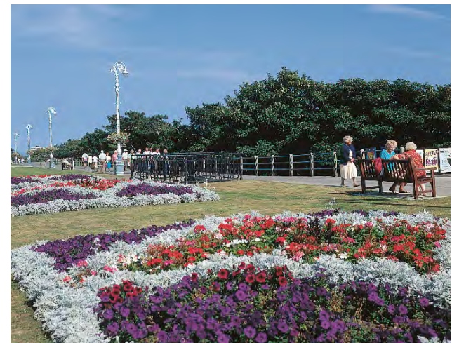
Flowerbeds on the Leas