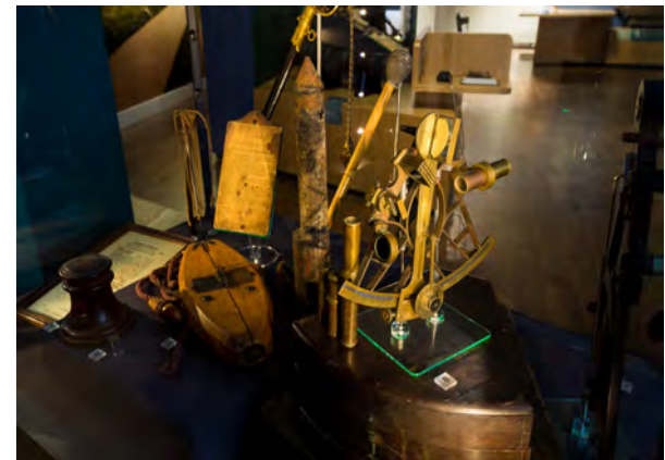
Museum Exhibit - Maritime Folkestone

The Personnel Sub-Committee wish to extend they're thanks to our team of loyal and dedicated officers, who go above and beyond to provide the town and Councillors with a gold star service and who under the Town Clerk's excellent leadership, work tirelessly to achieve the many and varied aims and objectives detailed in Councils adopted Corporate Plan. As I am sure all Councillors will agree the Town Clerk and her team make visiting the Town Hall an absolute pleasure for all ages, nothing is ever too much trouble and advice is freely given, thus enabling our Town Council to continue to grow and provide a first class service to our residents and visitors alike.