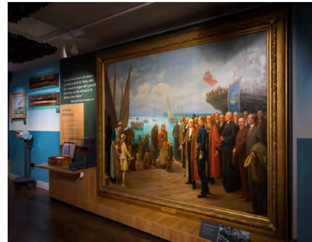
Museum Exhibit - Frontline Folkestone