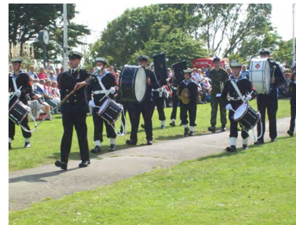
Armed Forces Day