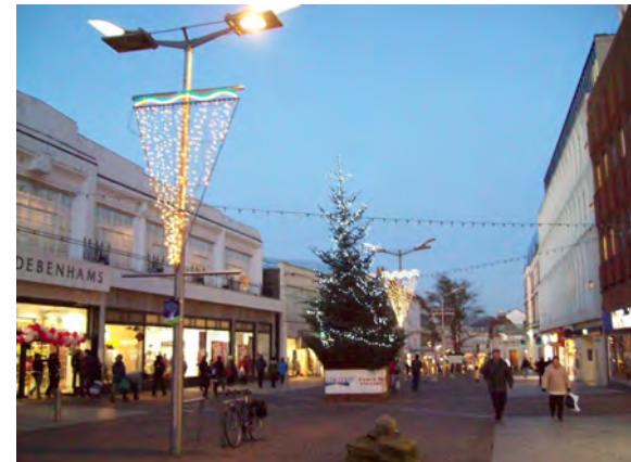
Christmas Lights in Folkestone