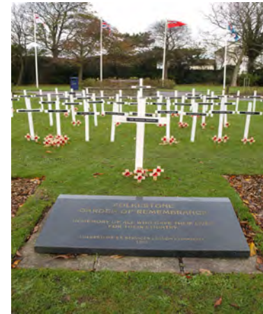
Garden of Remembrance Crosses

Weds 27 - Holocaust Memorial Day, Garden of Remembrance