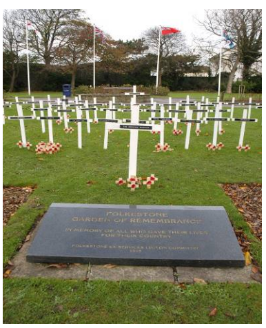
Garden of Remembrance Crosses