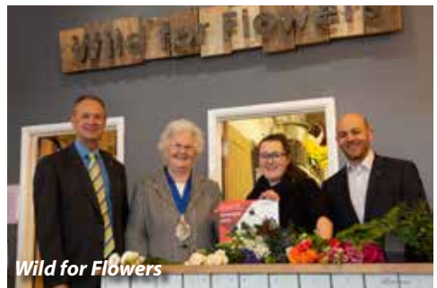
Wild for Flowers