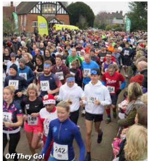
Off They Go!

Every year Channel Rotary helps the Saltwood Boxing Day Run with things like registrations, cash collection, marshalling and the local media.