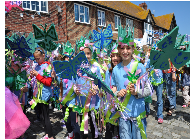
Local children taking part in the Charivari