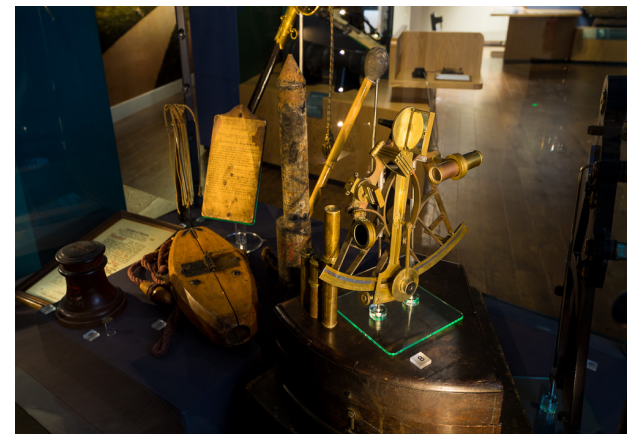
Museum Exhibit - Maritime Folkestone

The Personnel Sub-Committee wish to extend they're thanks to our team of loyal and dedicated officers, who go above and beyond to provide the town and Councillors with a gold star service and who under the Town Clerk's excellent leadership, work tirelessly to achieve the many and varied aims and objectives detailed in Councils adopted Corporate Plan. As I am sure all Councillors will agree the Town Clerk and her team make visiting the Town Hall an absolute pleasure for all ages, nothing is ever too much trouble and advice is freely given, thus enabling our Town Council to continue to grow and provide a first class service to our residents and visitors alike.