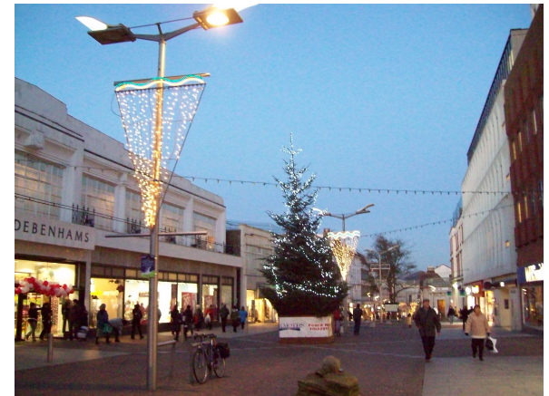
Christmas Lights in Folkestone