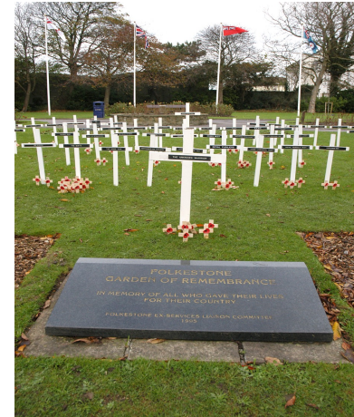
Garden of Remembrance Crosses

Weds 27 - Holocaust Memorial Day, Garden of Remembrance