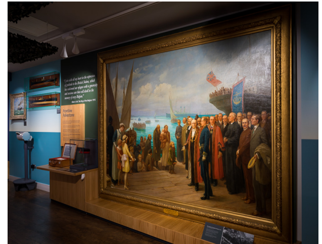
Museum Exhibit - Frontline Folkestone