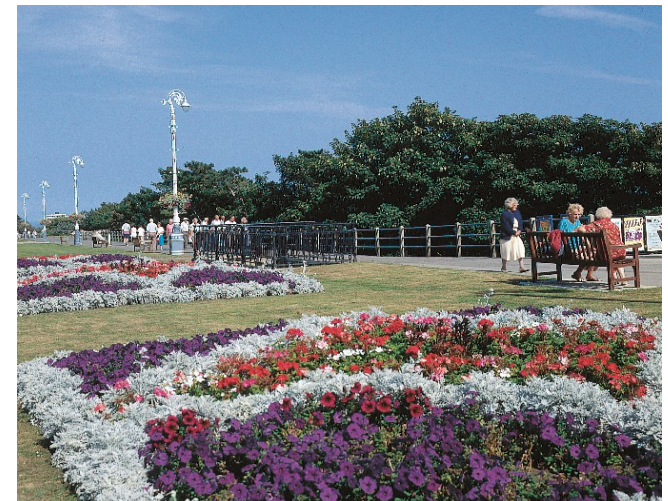
Flowerbeds on the Leas