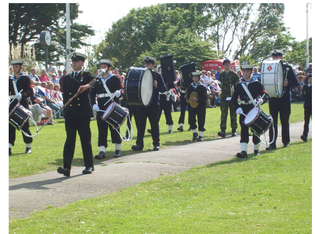
Armed Forces Day